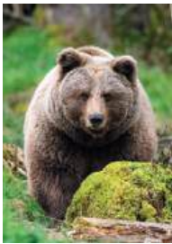
Isa the Temperamental (born 2004)

JURKA used to live in the wild in Italy. She is the mother of Bruno, the first wild bear in Germany in over 100 years, who was shot in Bavaria in 2006. Unfortunately, thoughtless people lured her with food. Thus, she lost her natural fear of people and her offspring imitated her behaviour. As a result, she had to be taken from the wild.