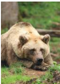
Daria the Relaxed (born 1991)

As a wild bear, ISA had repeatedly approached housing estates in Italy, which led to her capture in 2011. For 10 years, she stayed in an outdoor enclosure in Trento. When we heard that ISA was to be transferred to a zoo due to reconstruction work, we stepped in to save her from this fate.