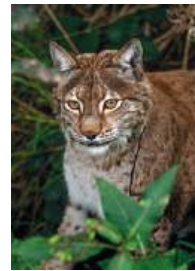
Hero the Heroic (born 24th May 2015)

KIRA, KOLJA and KLEO come from a contact zoo in Germany. They were snatched from their mothers at an early age and raised by humans to pose for pictures with tourists in so-called “animal audiences”. This has now come to an end, and they can finally be wolves! KLEO and KIRA form a pack while KOLJA is socialized with Gaia.