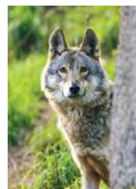
Gaia the Sharp (born 2017)

HERO was bred as part of a project to reintroduce lynx into Lithuania's wilderness. However, due to a physical birth defect, he was condemned to a life in a small pen and eventually even to death. Fortunately, we could save him just in time. So don't be surprised about his odd-looking gait. HERO has this deficiency from birth and copes just fine!