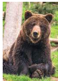
Jana the Impressive (born 2010)

Only a few weeks old, AGONIS was separated from his mother and taken from the wild. Chained to an iron stake, he was abused as a customer attraction by a restaurant owner. Today, AGONIS thoroughly enjoys exploring his surroundings in all detail and finds pleasure in restructuring our outdoor enclosures.