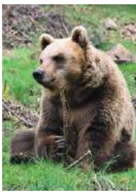
Franca the Brave (born 14 January 2002)

DARIA used to live in a Spanish zoo. After its shutdown, she was simply left behind without any food or water (!). Fortunately, her days in a tiny enclosure are history. Now, our “grand dame” DARIA enjoys her home turf in the Black Forest.